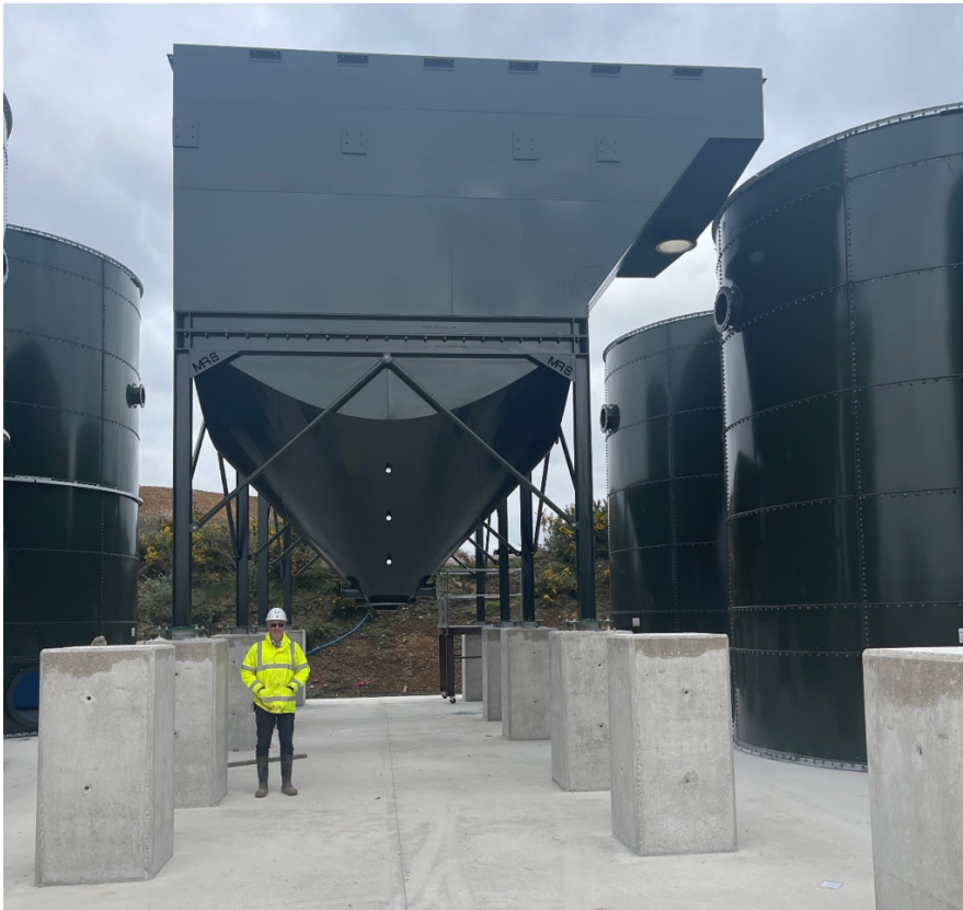
Photo 4 – A lamella clarifier, located between the reaction tanks.