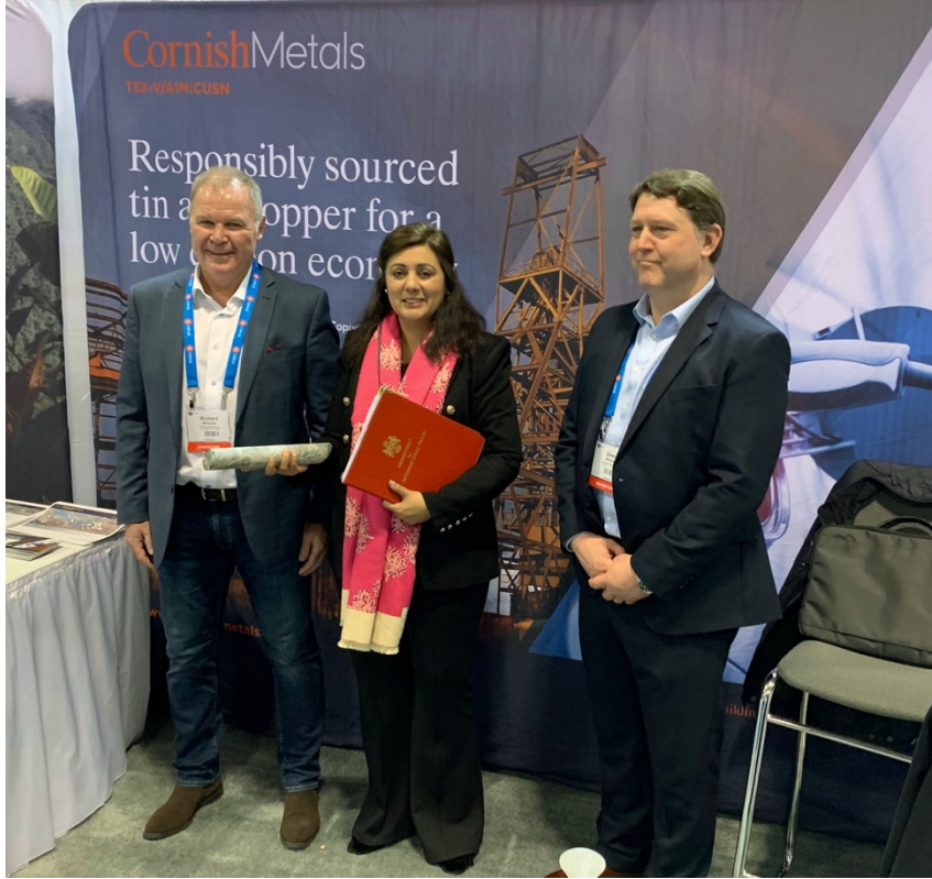
Photo 1: UK Minister of State at the Department for Business and Trade Nusrat Ghani visiting Cornish Metals' booth at the PDAC, March 5, 2023.