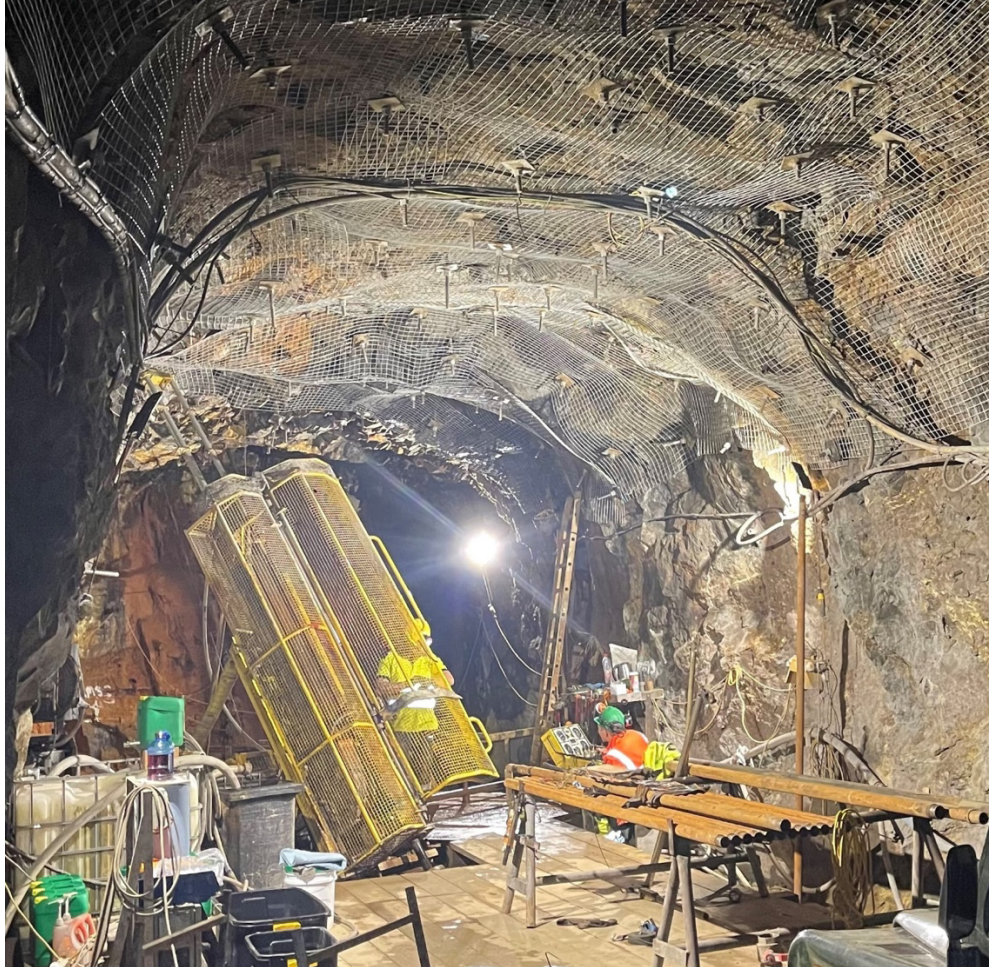
Photo 5 – drilling from the Tuckingmill decline to collect metallurgical samples from the Roskear zone.